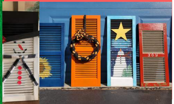
Gamma Shutter Art