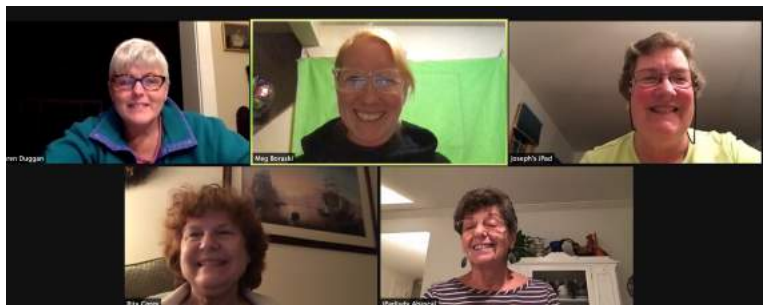
Beta Zoom Meeting