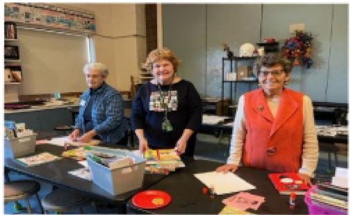
Beta members compiling book boxes to be delivered to doctors' waiting rooms, the courthouse and a local shelter.