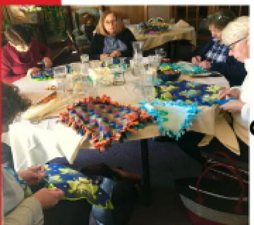
Zeta members making comfort blankets for UVM Children's Hospital.