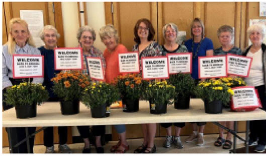
ETA members bring mums and signs to welcome teachers back to school.