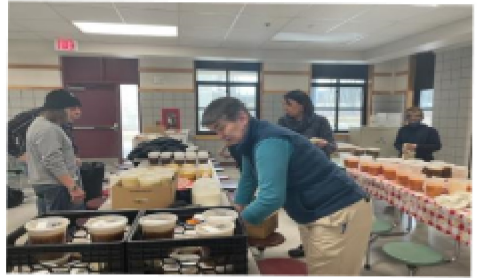
Gamma members pack soups for Soup Bowls for Hunger drive-by event supporting local food shelves in Rutland County.