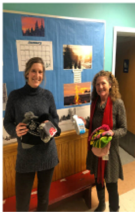
Epsilon members get ready to contribute to EEC's Winter Warmth project.