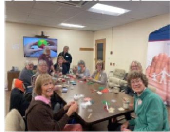
Participants from VT and NH are all smiles during their ornament making workshop .

Annually, DKG VT hosts an arts retreat where members and guests explore a variety of arts and crafts, and enjoy a pot