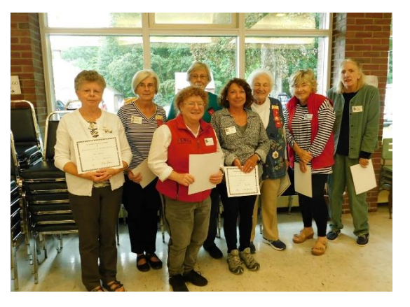
Chapter members received Certificates of Appreciation for their years of service to DKG.