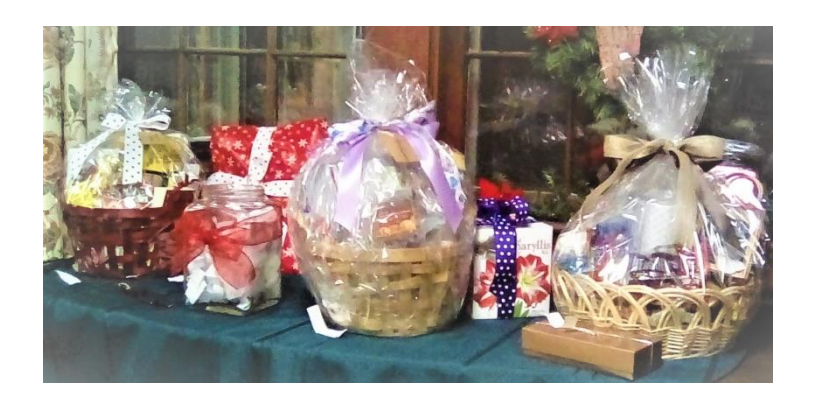
Holiday Raffle Baskets – Annual Fundraiser