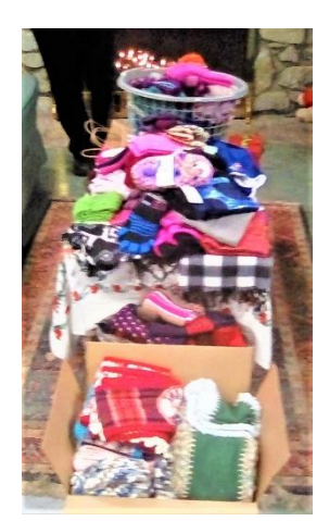
Mittens, hats and scarves collected for local school children and the Bennington Coalition for the Homeless.